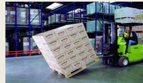
Boxes are titled after placing Grip Sheet between layers & no stretch film is used.