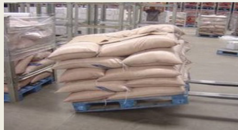
Bags are titled after placing Grip sheet between layers & no stretch film is used.